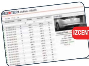
IZCENTRAL FOR SYMMETRY™ SOFTWARE