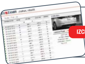
IZCENTRAL FOR GALAXY SOFTWARE