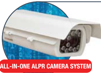
ALL-IN-ONE ALPR CAMERA SYSTEM