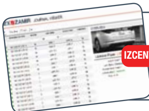
IZCENTRAL FOR OCULARIS™ SOFTWARE