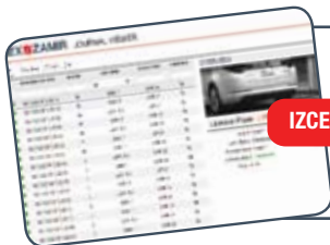
IZCENTRAL FOR EXACQVISION SOFTWARE